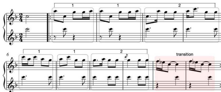
Figure 3 Score Example 2

These two pieces of music were each played 15 times during a wedding. Next, the authors analyze the two pieces of music separately.