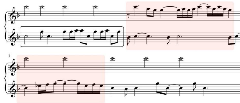
Figure 5 Score Example 4