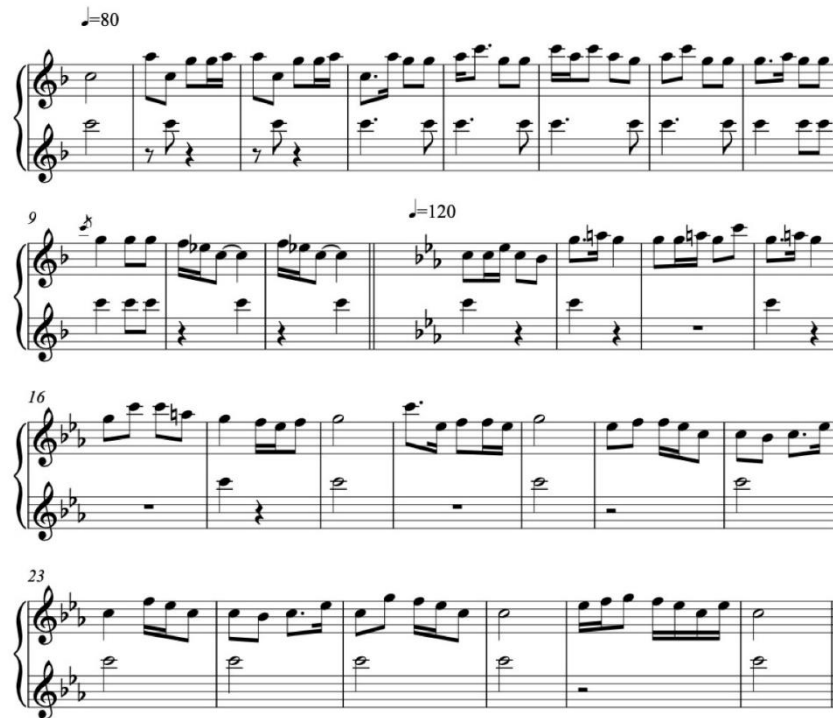
Figure 2 Score example 1