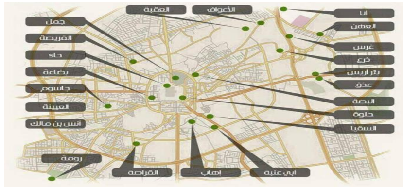
"A group of water well sites, including the Abu Anaba well and water from as-Suqya " (Al-Miski)

According to Ibn Saad, the Prophet Muhammad set up camp at the Abu Inaba well, which is just over a mile away from the city and evaluated the warriors that accompanied him and rejected the young ones of them. (Ibn Saad, 1986; Al-Hazmi, 1418).