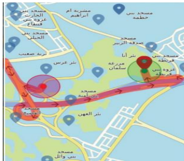
Site of Anna's Well (Tracing the Steps of the Prophet)