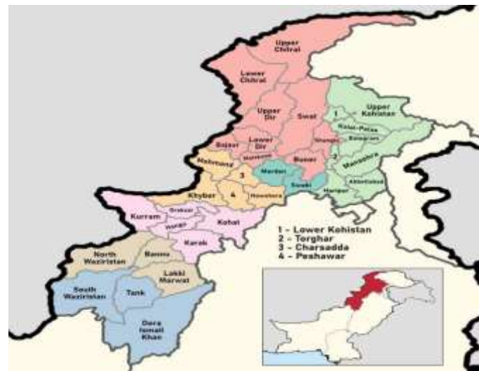
Figure 2. Districts of Khyber Pakhtunkhwa (KPK), Pakistan