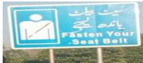
English in the Abjad Writing System