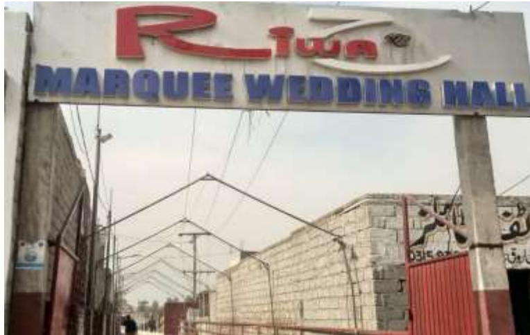
Figure 10: Riwaḡ Wedding Hall (Signboard)

in its primary text. It has been done by incorporating the term ‘Riwaḡ’ in its title as ‘Riwaḡ Wedding Hall’.