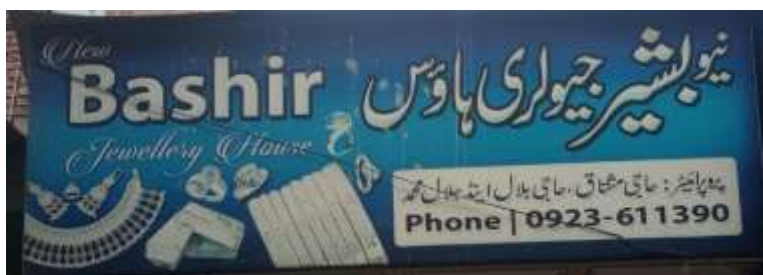
Figure 3: Jewelry House (Shop signboard)

Figure 3 displays the signboard of a jewelry shop which is entitled as 'نیوبشیر جیولری ہاؤس' (New Bashir Jewelry House). The signboard is chock-full of abjad-written English lexical terms; for instance, نیو (new), جیولری (jewelry), ہاؤس (house), and پروپرائیٹر (proprietor). The conjunction that joins the names of proprietors is also an example of writing system mimicry. Although the pronunciation of these words has not been affected, the writing system has been modified from alphabetic to abjad. Similarly, linguistic landscape actors have chosen the Nastaleeq script rather than the Latin one.