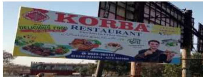
Figure 7: Korba Restaurant (Billboard Advertisement) Source: Nowshera-Peshawar Road

Figure 7 illustrates Korba restaurant's billboard advertisement. The term 'Korba' (کوربه) means 'host' (the one who attends or receives others as guests). This billboard advertisement has employed three scripts, Latin, Naskh, and the Nastaleeq, whereas two writing systems are used: alphabetic and abjad. These aforementioned writing systems, along with the former two scripts, convey primary information. For instance, the name of the restaurant, address, the name of the program, the channel name, etc. Furthermore, additional details are provided through the abjad writing system and the Nastaleeq script. Korba (کوربه), a Pashto word, is written in Roman letters, which uses different script and writing system than Pashto. The color and font selection signifies the emblematic status of English in Pakistan.