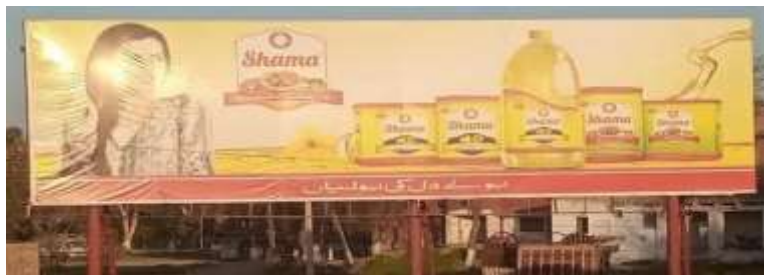
Figure 5: Shama Cooking Oil (Billboard Advertisement)

Shama cooking oil's billboard advertisement is illustrated in Figure 5. Even though Shama (شمع) is an Urdu word, linguistic landscape actors have used Roman letters and the alphabetic writing system to name cooking oil as 'Shama cooking oil'. The term 'Shama' (شمع) refers to 'candle' in English. In this way, they have changed the script from Nastaleeq (a combination of Naskh and Taleeq Arabic scripts) to Roman and the writing system from abjad to alphabetic.