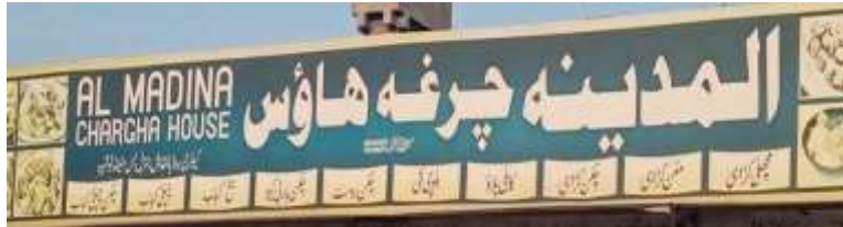
Figure 8: Roadside Hotel (Signboard)

A roadside hotel's signboard is typified in Figure 8. It has presented its name in both Roman letters and in the Naskh script, employing the alphabetic and the abjad writing systems, respectively. The abjad writing system and the Naskh style is adopted for its Pashto version (المدينه چرغه هاؤس), while the alphabetic writing system and the Roman script for its English name (Al-Madina Chargha House). Chargha (چرغه), a Pashto word, means 'chicken'. This term is also rendered in Roman letters and script. Romanization refers to the conversion of writing from different writing systems to the Roman (Latin) script. Hence, the restaurants' title is Romanized in this sign. It elucidates writing system mimicry where LL actors mimic the Latin script. Similarly, they mimic the Nastaleeq script and the abjad writing system for different available dishes. Mutton karahi (مٹن کڑاہی), chicken karahi (چکن کڑاہی), and chicken chapli kabab (چکن چپلی کباب) are just a few examples.