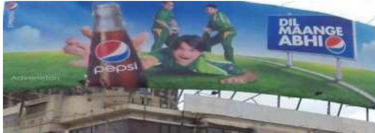
Figure 6: Pepsi (Billboard Advertisement)

and the Roman script rather than the abjad writing system and the Nastaleeq script.