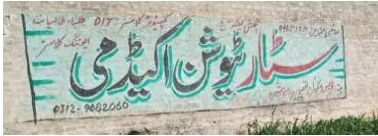
Figure 4: Star Tuition Academy (Graffiti)