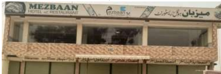
Figure 9: Mezbaan Hotel and Restaurant (Signboard)

Figure 9 is divided into three sections: left, center, and right. Its right margin is an example of the abjad writing system utilizing English terms. On the other hand, its left margin has employed the Urdu word 'Mazbaan' written in Roman letters. Additionally, the sign makers have integrated two quite different writing systems by fitting in the term 'mezbaan' in its center.