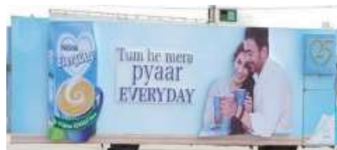
Urdu in the Alphabetic Writing System