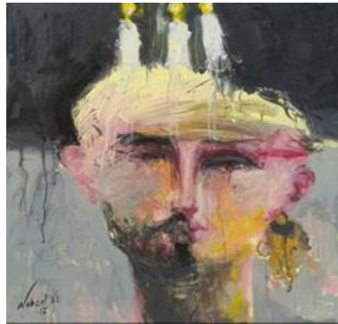
(Fig. 7) Zakaria tray