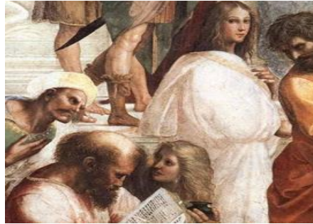
(Fig. 4) The School of Athens, Raphael Sanzio, 1511 AD