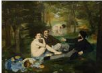
(Fig. 9) Parting 1869