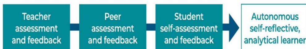
Figure 2. Peer and self-assessment for students.

Students and teachers will have obligations while utilizing web-based peer evaluation systems. Frequently, instructors have a substantial effect on the results of routine classroom assessments (Hung & Chou, 2015). The teacher provides some direction, and the students work on a topic for a limited length of time under that guidance. As a direct consequence of this, students often only receive comments from their teachers. When participating in web-based peer evaluations, students, in addition to their more typical role as students, take on a portion of the responsibilities of teachers in the capacities of examiners and providers of feedback (Hagenauer et al., 2015). Students are required to exert more effort than they would in a circumstance that is more normal since the mechanism makes it possible for them to engage with one another and work together rather than just work alone (Reinholz, 2015). The fact that raters were also competitors, which may impair their neutrality on assessments, was something that some students found to be very frustrating about the process of peer evaluation (Carless & Boud, 2018). In addition, the use of web technology may broaden the opportunities available to students for connecting with their classmates beyond the constraints of time and location, given that activities may be carried out either inside or outside of the classroom. Figure 2 shows the self and peer-assessment process for students;