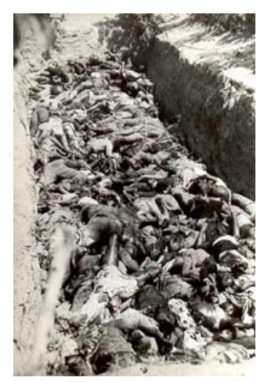
Figure 3: Mass grave, Cassinga (Pagano)

It was widely syndicated and published by newspapers throughout the world.<sup>37</sup> In June 1978, SWAPO issued a bulletin with the Pagano image on the cover with the byline "Massacre at Kassinga: climax of Pretoria's all-out campaign against the Namibian resistance."<sup>38</sup> The picture was also included in the Kassinga File, a collection of images compiled by Pagano and Swedish filmmaker Sven Asberg.<sup>39</sup> The file was distributed to the network of agencies and organisations affiliated to the international anti-apartheid movement. These organisations distributed and displayed the images of the mass grave at public exhibitions and included it in publications. The shot became emblematic of the Cassinga massacre.