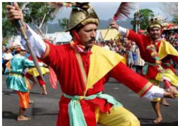
Figure 5. Banda Cakalele Dance Movement

The following cultural acculturation is in the cakalele banda dance movement; here is Figure 5 display of the cakalele banda movement.