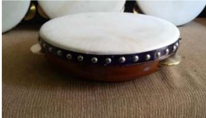
Figure 4. Tambourine, one of the musical instruments of Cakalele Banda

Figure 4 shows that the acculturation of Asian and Middle Eastern culture is very strong in the cakalele banda dance. The tambourine is a traditional musical instrument that originated in various regions of the world, especially in Asia and the Middle East. (Doubleday, 1999; Rakhimova et al., 2023). Although there are variations in form and use, the Rebana generally consists of a drum made of leather stretched over a wooden or metal frame. The tambourine has specific characteristics in each region and is used in different cultural and religious contexts. In addition, European cultural influences can also be found in some aspects of Cakalele Banda. For example, in Cakalele Banda performances, European musical instruments, such as drums or trumpets (Bowles, 2017), may be adapted into the context of local traditions. Also, in terms of costumes, there may be elements inspired by European clothing styles or the use of materials imported from Europe.