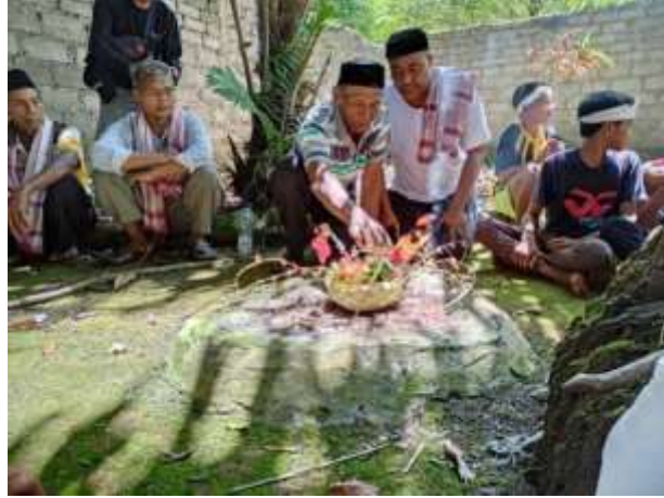
The process of tahlilan and pilgrimage

The prayers aim to ask for safety on the journey and return from the pilgrimage, and there is no shortage of anything. The men, young and old, from the three administrative lands included in the Namasawar petuanan, which numbered approximately 30 people, were ready to participate in the pilgrimage. The pilgrims were divided into three groups, namely groups 1 and 2 of the land route and 3 of the sea route. The first group was led by an Orlima who was in charge of the grave pilgrimage with the destinations of; Rumah Adat, Mesang Jadi, Gunung Manangis, Gunung Tujuh, Batu Lanang, Parigi Laci; this group was then called the "Gunung tujuh" group. The Orlima Kepala and an Imam lead the second group for a pilgrimage to five tombs, namely; Rumah Adat, Kebun Kelapa, Papan Berek, Boy Kerang, Kubor Gila, Kota Banda, Batu Masjid, and Parigi Laci. An Orlima leads the third group and gets a route by sea: Rumah Adat, Gunung Api, and Parigi Laci.