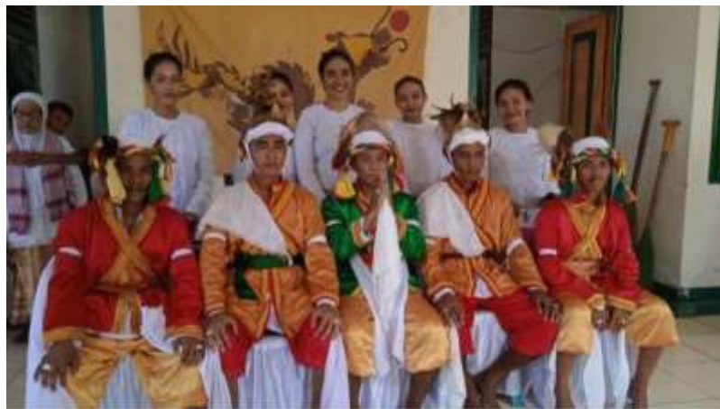
Figure 2. Banda Cakalele dancers

Figure 2 shows that the Cakalele Banda traditional dress reflects Asian cultural acculturation in various design aspects and elements. This can be seen in the following examples. Chinese influence: In some Cakalele Banda costumes, the influence of traditional Chinese clothing is visible, especially in the form of high collars and intricate embroidery decorations. This suggests a cultural exchange between the Banda people and Chinese traders or colonizers in the past (Lape, 2000). As for the motifs and patterns of Banda's Cakalele traditional dress, there are motifs and patterns inspired by traditional Asian art and design. For example, there is the use of dragon, phoenix, or lotus flower motifs, common in traditional Asian art and fabrics (Williams, 2006); Cakalele Banda's use of colors and fabrics can also show the influence of Asian culture. Some outfits use bright colors such as red, gold, or green, often associated with luck and strength in Asian cultures (Palmer et al., 2012). In addition, the use of silk fabrics or fabrics that have an Asian smoothness and luster can also be found in some costumes; the accessories used in Cakalele Banda traditional clothing can also reflect Asian cultural acculturation, including jewelry such as bracelets or necklaces that have designs and motifs similar to traditional Asian jewelry such as beads or jade (Nguyen, 2008).