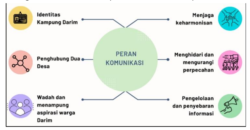
Figure 1. The Role of Group Communication in Empowerment