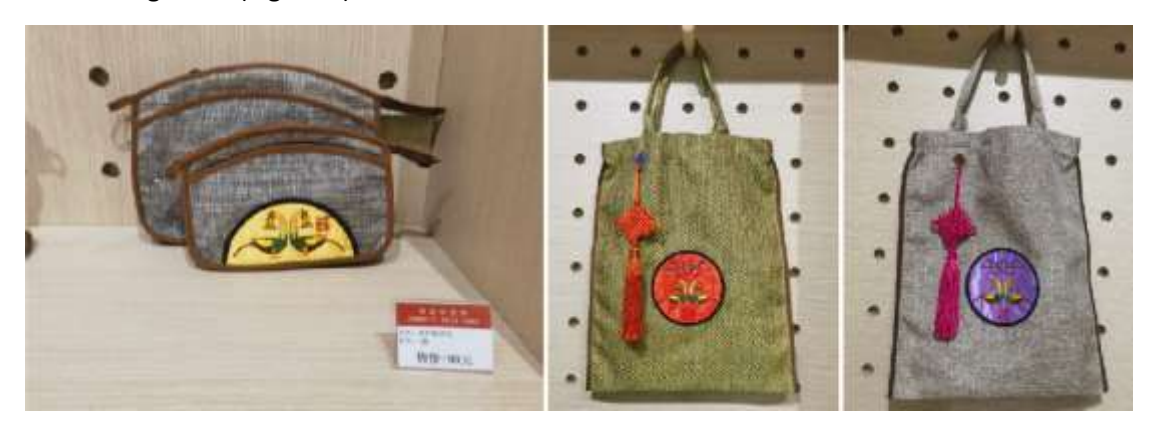
Figure 2: Fashion cultural and creative products in Guangxi Zhuang Autonomous Region Museum---Fengdeng handbag

connotations. For example, the Museum of Guangxi Zhuang Autonomous Region launched a fashionable cultural and creative product inspired by Guangxi Luoyue bronze phoenix lanterns—the phoenix lantern handbag. It has cultural connotations and is welcomed by consumers. The cultural and creative industry is a cultural industry with local characteristics. Cultural and creative products endowed with cultural connotations have gradually become fashionable tourism cultural and creative products favored by audiences and have a significant market value that cannot be ignored (Figure 2).