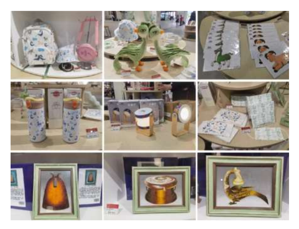
Figure 3: Series of cultural and creative products with bronze elements in Guangxi Zhuang Autonomous Region Museum