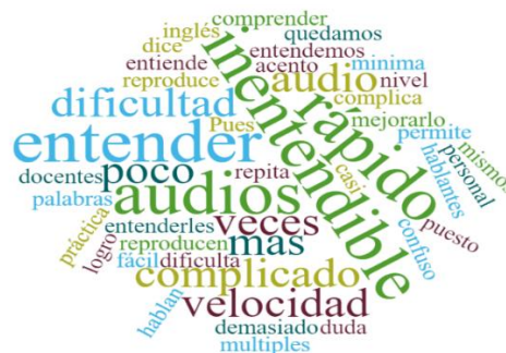
Figure 1 How difficult is it to understand the audio from the books when learning?

Interpretation of Data from the Focus Group