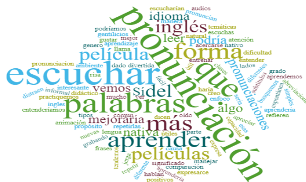
Figure 4 Do you consider learning English through films would be helpful for your listening skills? Why? Why not?

Film clips as a learning activity in the classroom are a didactic, strategic, and innovative tool for the interviewees. According to the students, it would be highly interesting because in this way they could familiarize themselves with the language and learning would not be monotonous. Film clips would help students to better comprehend each audio if a picture of what it refers to is shown. For them, this would improve their pronunciation because they would be practicing their listening with native speakers of the target language.