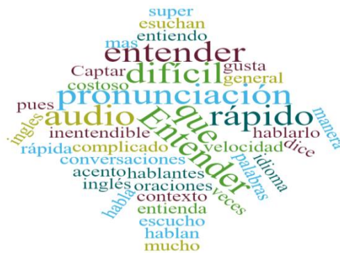
Figure 2 What challenges do you face when developing listening skills?

The interviewees agreed that understanding the audio provided by the books is very difficult for them. Various factors such as accents, pronunciation, contractions, people speaking very fast, and their low level of English which does not allow them to catch complete sentences influence their learning process. Besides the fact that the audios are usually repeated only twice.